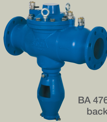
BA 4760 Drinking water backflow preventor