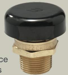
Lead Free Water Service Vacuum Relief Valves