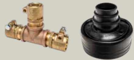
Fittings and Accessories