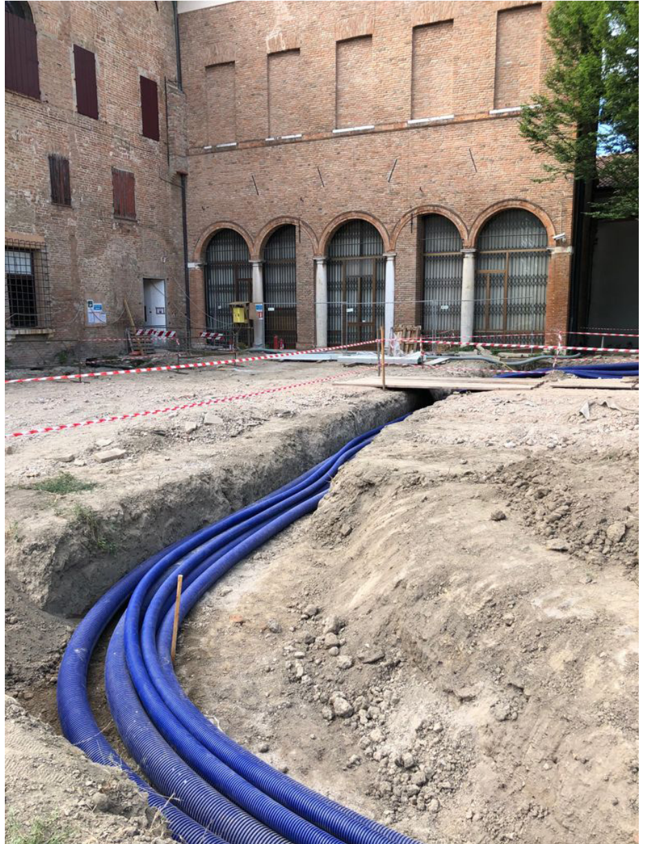
Microflex pre-insulated flexible piping system

Watts was chosen as a reliable partner for the renovation of the magnificent Palazzo Diamanti in Ferrara . iMartini Srl , an MEP engineering firm operating in the plumbing and heating sector, used the Microflex pre-insulated flexible piping system to create the cooling and heating system, notably in the interior spaces in which the correct level of indoor comfort had to be guaranteed in order to protect the artistic heritage.