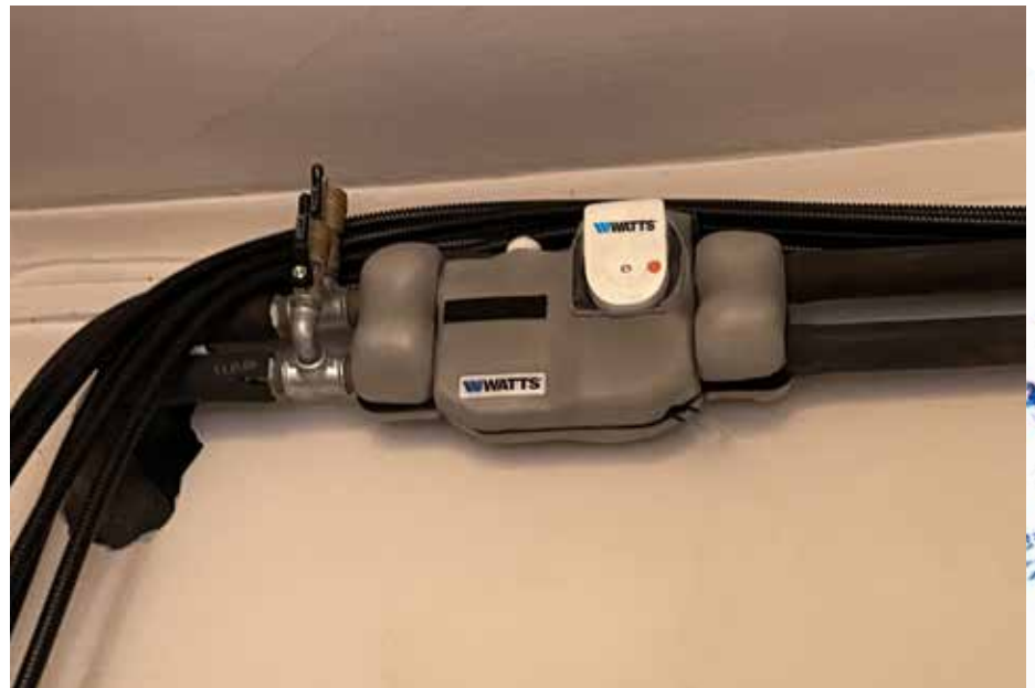
An overview of the installation.

Compliant with MID Directive 2014/32/EU D.Lgs n 22 2/02/07, the My Home 2 thermoregulation and heat metering module of the Domocompact Series by Watts, in fact, is programmed according to the real plant requirements on the basis of the flow rate needs (required up to 1500 l/h).